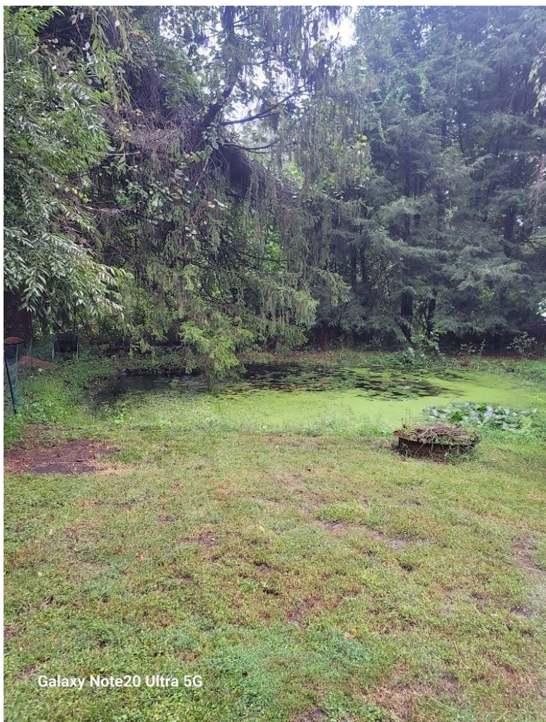
Galaxy Note20 Ultra 5G

We've had a wet season this summer! I was looking at my vernal pond yesterday, amazed that it is filled to the brim right now. Last year at this time, it was completely drained by a summer drought. Maybe that's why all the little frogs and peepers still keep making such music at dusk!