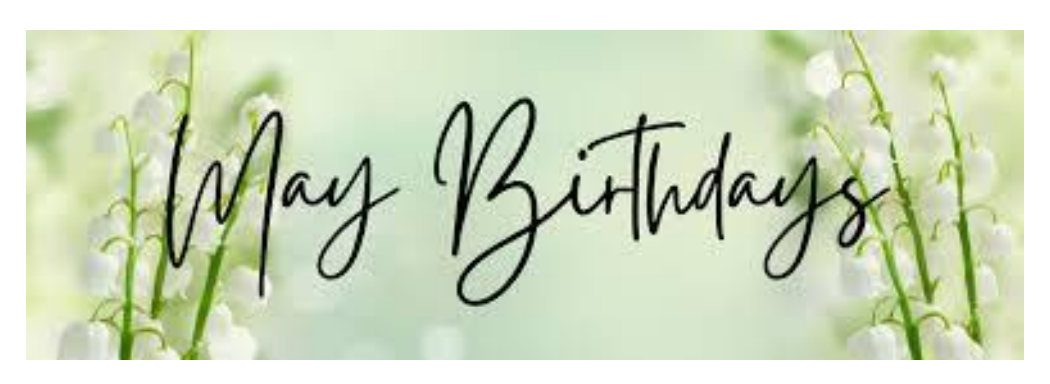
Happy Birthday to the following people and to anyone we may have missed we will keep you in our prayers.