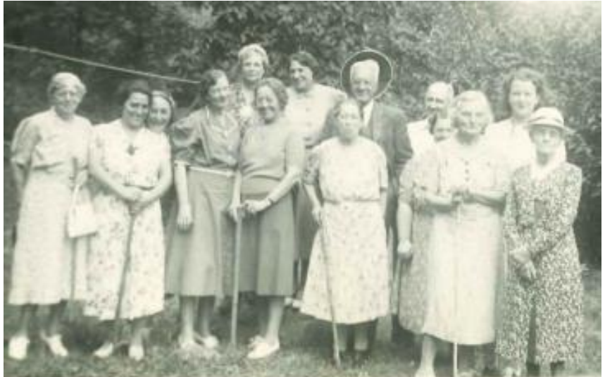
The Ladies Improvement Society