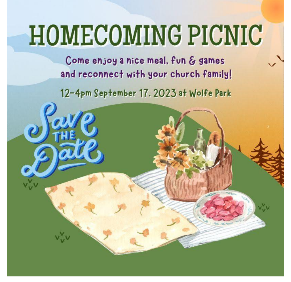
Homecoming picnic signup link:

https://www.signupgenius.com/go/10c0d44a8ac22a2fb6-mcchomecoming