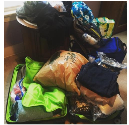
Packing Just What I Could Carry