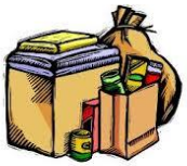
Food Pantry Donations Needed

The Monroe Food Pantry Is Very Low On Supplies : While the need is still great, donations to the food pantry have decreased. To donate perishable items such as eggs or milk please call 452-3770 to arrange a drop off time. For nonperishable items please place in the bin in the Rexford House-Thank you for your generosity. Here is what the pantry needs the most for our neighbors: