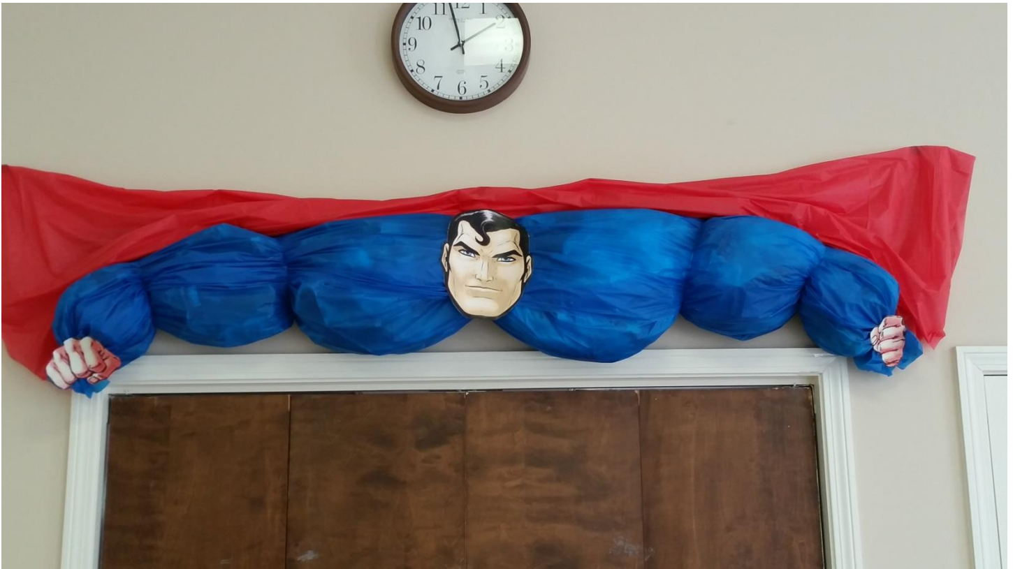
Superman is in Charge of Snack at Mess Hall