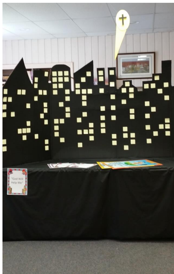
Gotham City Skyline