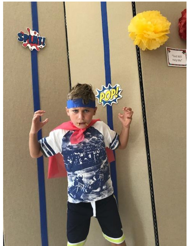
Campers posing in front of the Wall of Justice