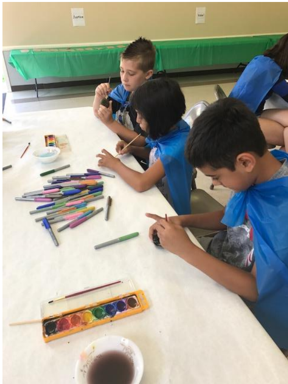
Campers working on Crafts