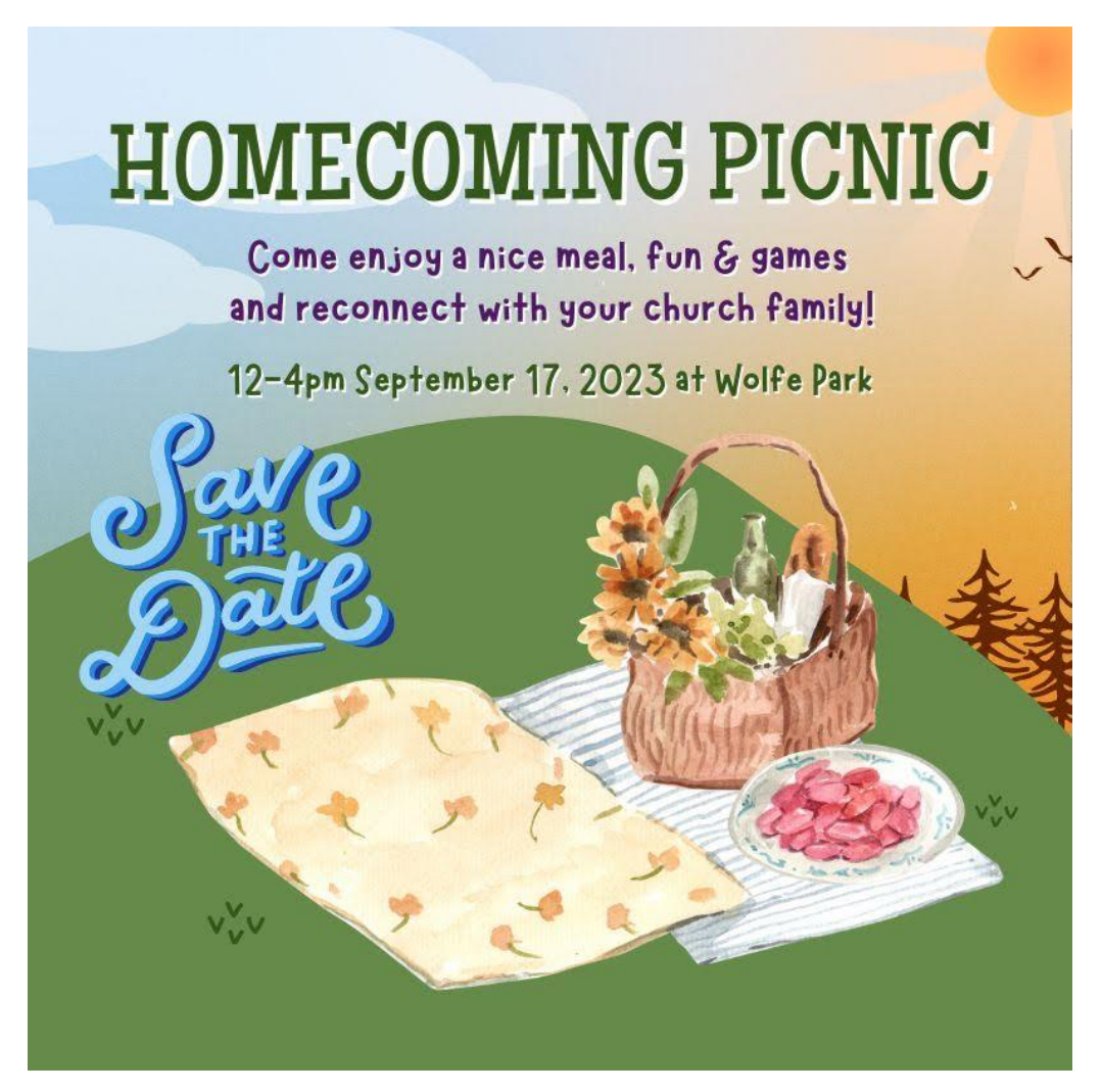
Sign-up Sheet in Wilton Hall!