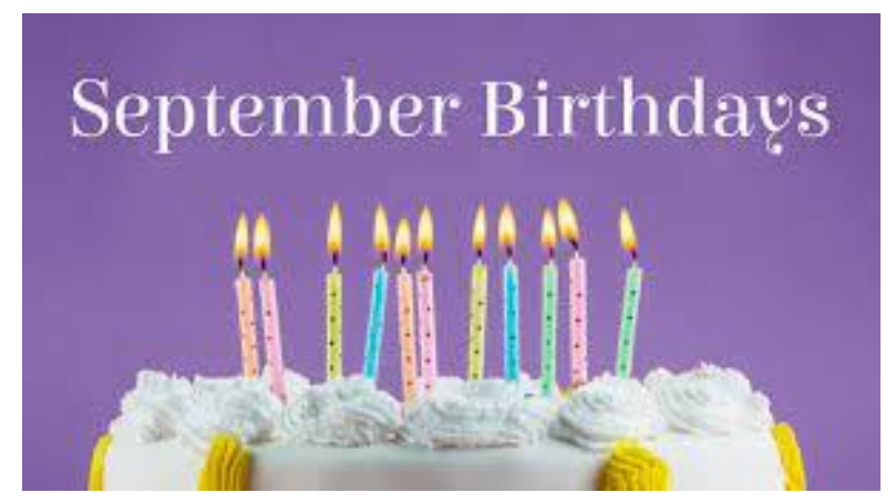
Happy September Birthday to the following people and to anyone we may have missed we will keep you in our prayers.