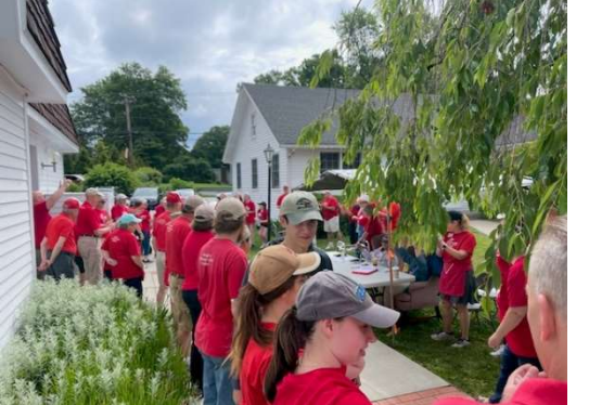
Saturday's Opening Prayer Circle