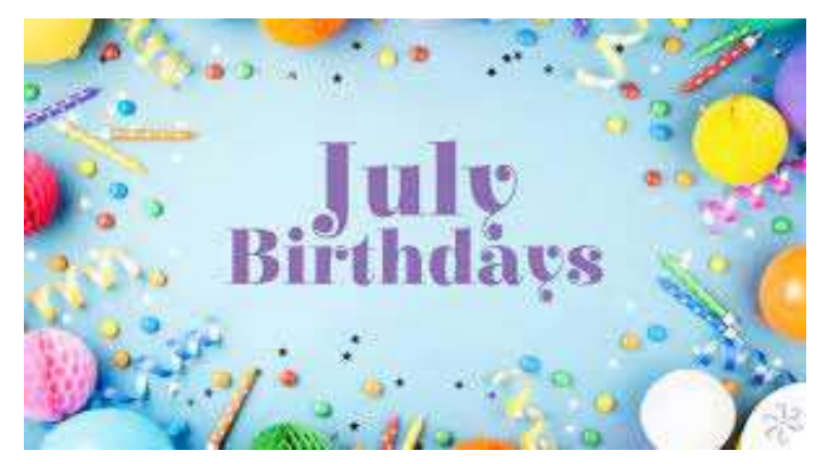
Happy July Birthday to the following people and to anyone we may have missed we will keep you in our prayers.