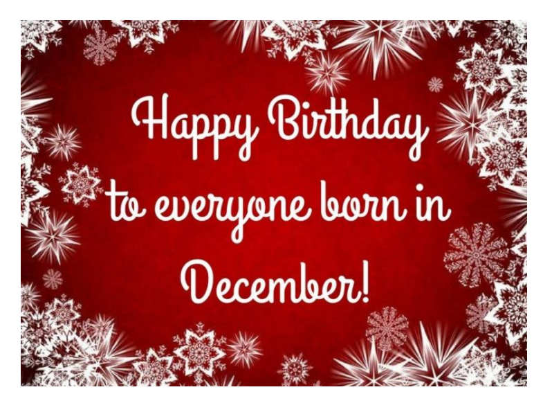
Happy December Birthday to the following people and to anyone we may have missed we will keep you in our prayers.